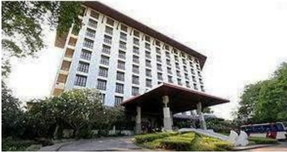
Chatrium Hotel, Yangon

YANGON: Chatrium Hotel INLE LAKE: Inle Resort Hotel MANDALAY: Mandalay Hill Resort Hotel MONYWA: Win Unity Resort BAGAN: Bagan Thande Hotel